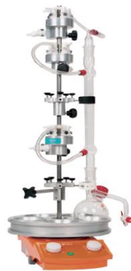
使用例②：蒸留 ディーンスタークフラスコ、Water Manifold、 Gas/Vacuum Manifold、冷却コンデンサ