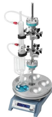
使用例③：抽出 250mLフラスコ、Water Manifold、ソッ クスレー抽出器、冷却コンデンサ