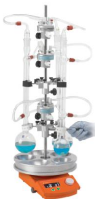
使用例①：合成 250mLフラスコ×5、Water Manifold、 Gas/Vacuum Manifold、 冷却コンデンサ